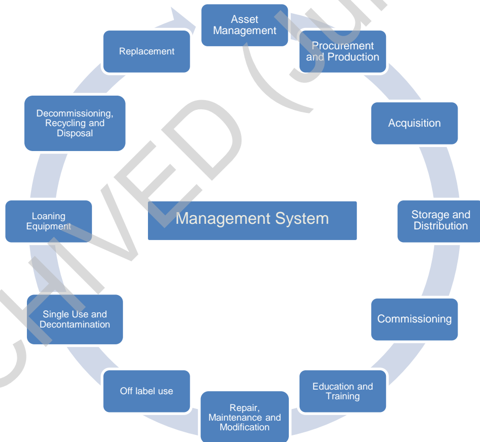
Figure 1: Management Process

2.1 Ensuring there is an effective management system in place for medical devices and equipment is critical to the provision of healthcare. Health technology, medical devices and equipment are vital for the delivery of a range of services covering diagnosis, therapy, monitoring and rehabilitation. They must be procured, managed and maintained appropriately in order to provide high quality patient care. Additionally, they must meet clinical, financial and information governance requirements to minimise the risk of adverse incidents/events occurring. Failure to manage health technology, medical devices and equipment proactively can be a significant risk to organisations and can lead to the same types of adverse incidents/events occurring repeatedly. Management systems in place must cover product recalls, adverse incidents/events and near misses as part of the overall proactive medical equipment management strategy required to minimise repeated occurrences.