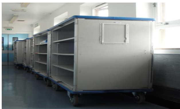
Figure 4: example of LP621 Transportation Cart.