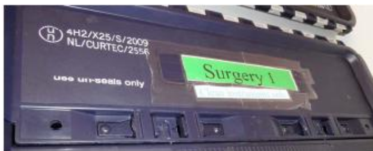
Figure 5:Packaging showing clear label