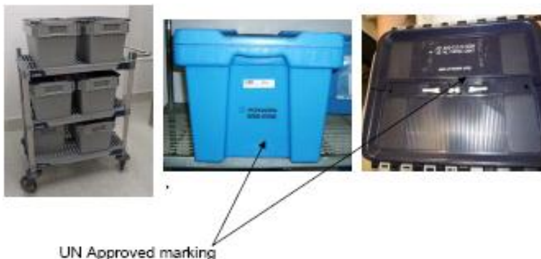
Figure 3: Examples of P621 individual packaging showing location of UN approved marking.